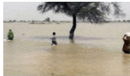
Fig 2. Flood damages in spate irrigated areas

The hill torrent brings flashy flood of shorter duration but very high magnitude. High flows breach earthen diversion bunds and deprive the cultivators from the use of this water. The flood water thus rushes downstream and damages crops, houses and other infrastructures. During the year 2004, a flood of about 67,600 cusecs discharge was observed in Sanghar Hill Torrent at Taunsa on June 6, 2004. A serious embayment along the left bank downstream of Indus Super Highway Bridge partially damaged the residential area. Sloughing of bank in a very large chunk took away a part of the Kacha colony whereby about 13 houses were fully taken by the flood currents along with their debris. One man and a number of animals were killed; a lot of household and food grain were taken away by the flood currents. In August 2008, a flood of 80,000 to 100,000 cusec passed through different parts of the Rajanpur district and more than 160 villages were submerged due to the flooding; resulting in the migration of over 6,000 people to safe places (Fig 2).