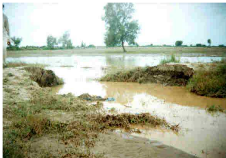
Fig. 3. Unmanaged Non perennial spate irrigation

The weir was constructed to divert spate flows to upstream fields. It performed this function, but it also considerably reduced the base flow to the downstream fields' which caused many tensions and conflicts. As conflicts became unbearable, the two communities (upstream & downstream farmers) reached a mutual agreement: they purposely blew up the weir (Fig. 5) and returned to their indigenous structures and water-sharing arrangement.