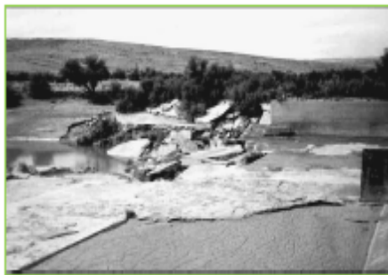
Fig. 5. Deliberately destroyed weir in Anambar Plain