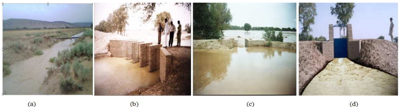
Fig. 7. Development of hill torrent structures made by PARC

The cultivated fields in Rod-Kohi irrigation System are large to the extent of 8 - 10 acres or more. The water application to the fields is crucial to control water in the flood season. Cost effective water application structures of