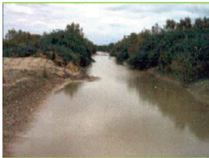
Fig. 4. Managed Non perennial spate irrigation